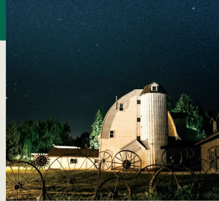
Uniontown, The Dahmen Barn

There's no doubt that the Palouse is one of the most spectacular areas in the world for photography! Rolling hills, vivid colors, and incredible contrasts lie in every direction, with local flora and fauna to photograph, as well.