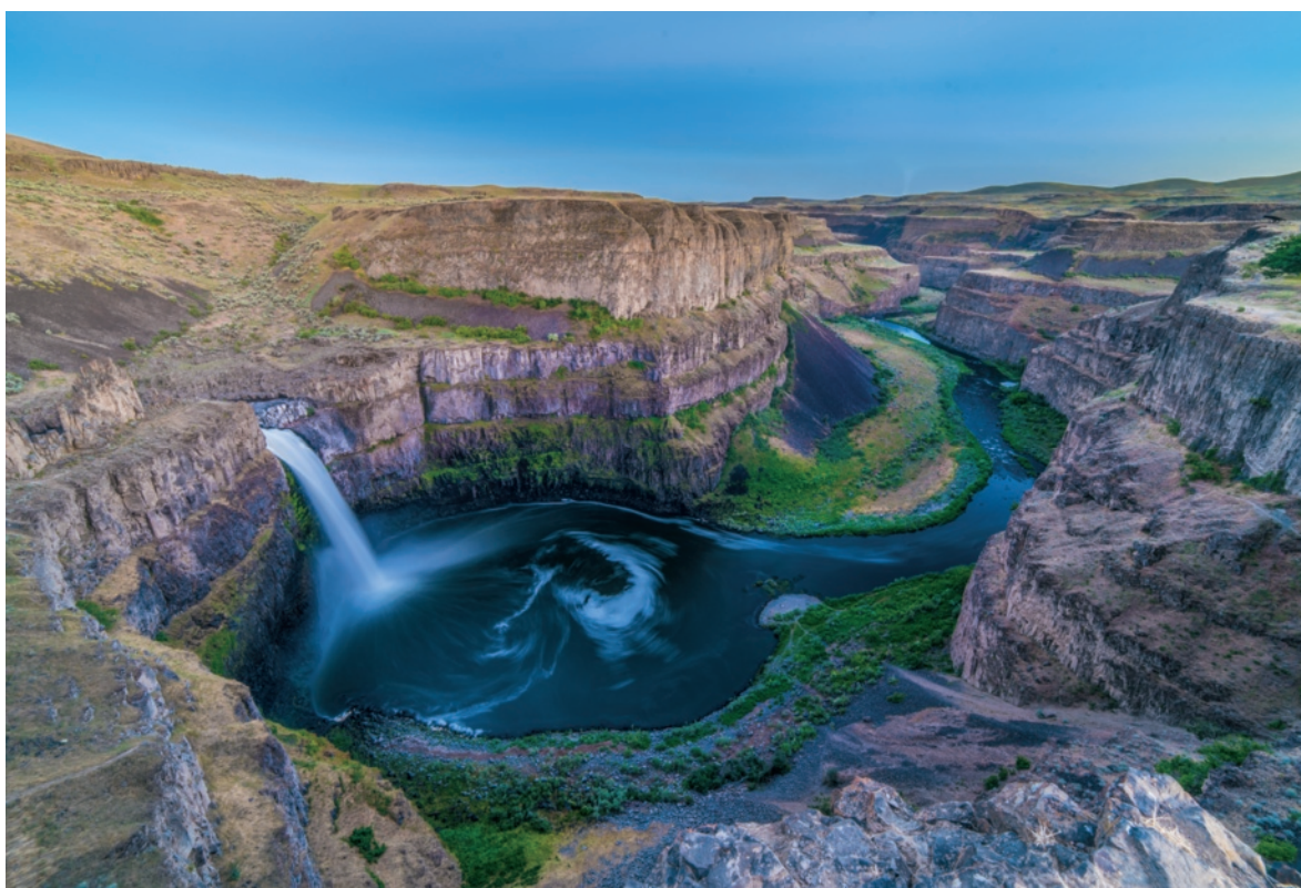
Palouse Falls

Do NOT trespass! Do not enter structures which appear to be abandoned. Do not walk into fields (currently growing or not, without permission of landowner.