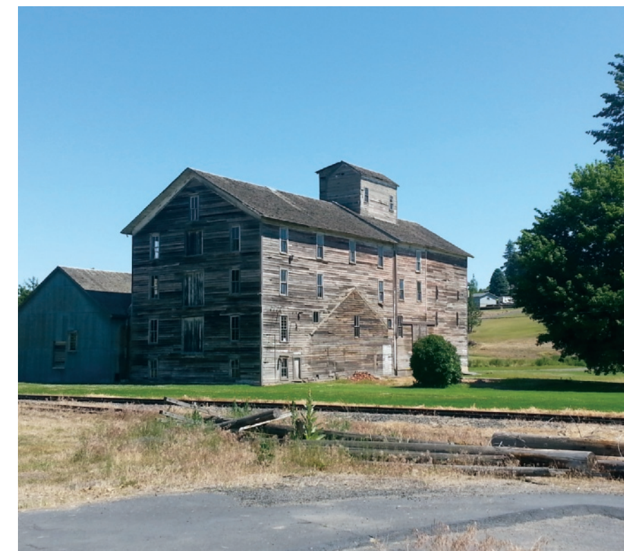
Oakesdale, JC Barron Flour Mill; Palouse Scenic Byway

1905 St Gall's Church: In Colton, north on Steptoe St off Hwy 195