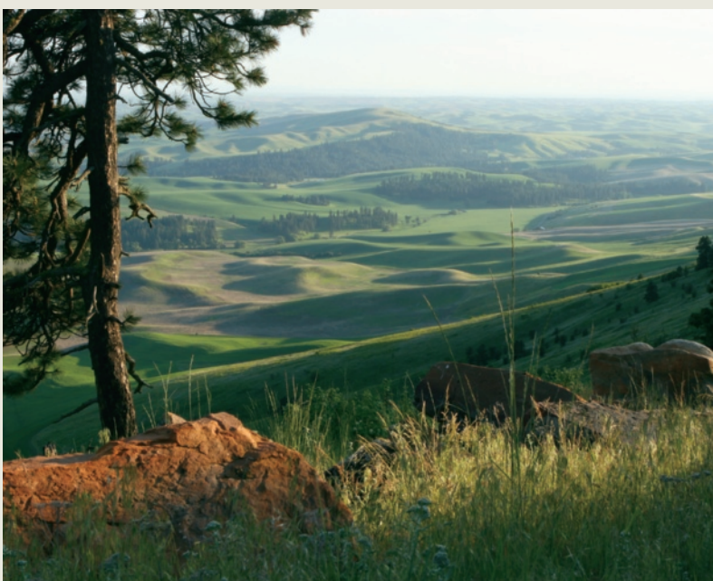
View from Kamiak Butte; Pullman Chamber

Feel free to share the Palouse adventure in thoughts and photos on facebook.com/PicturePerfectPalouse