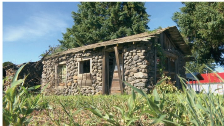
LaCrosse, Stone House; Palouse Scenic Byway

Day Trip 1 – Start in Pullman and travel north on Hwy 195 to Colfax. Stock up on supplies and coffee in their shops. Drive out to the Manning Rye Covered Bridge then continue west on Hwy 26 to LaCrosse. Stop for a meal in their café. Pick up groceries in the local store. See the stone houses and nearby Pampa Pond, then continue west to Palouse Falls State Park. Stop by any of the viewpoints on the map on your return trip.