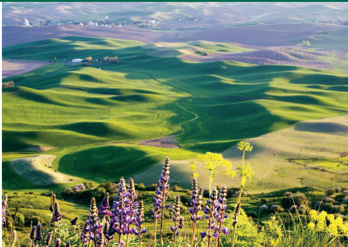
View from Steptoe Butte